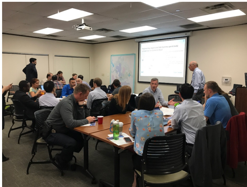
Austin workshop participants discuss approaches to setting speed limits.

Following the policymakers' breakfast, Austin Transportation Department staff working in the Vision Zero, engineering, active transportation, policy, and safety divisions then attended the full workshop with more in-depth content to implementing and administering speed management practices internally. The full workshop included 36 participants, most of whom were from the Austin Transportation Department with a few additional representatives from city council offices and law enforcement. There was close collaboration between grant project leaders and the Austin Transportation in setting the agenda and preparing data and sample projects for hands-on exercises with the group.